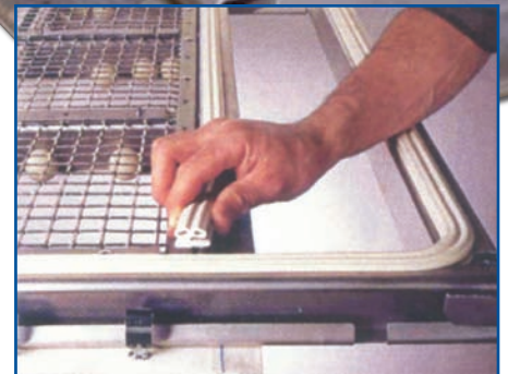
▲ A wider, continuous seal provides better sealing and longer seal-life.